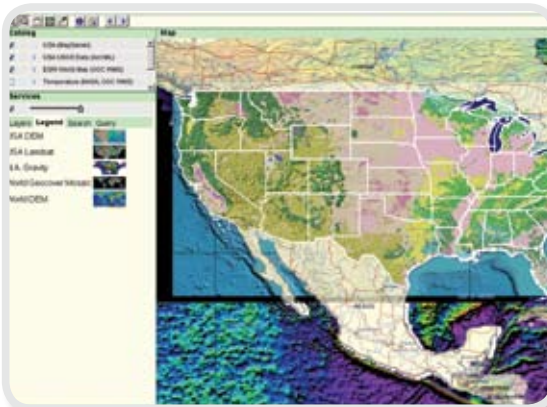
Image Web Server is used by local, state and federal governments, land information agencies, mineral and exploration companies, as well as defense departments.

ER Mapper Image Web Server is used worldwide by organizations that demand and expect the very best performance and results.